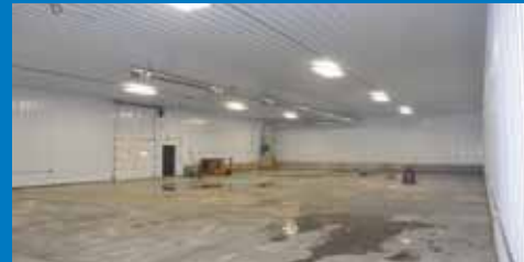
New Storage Facility Interior