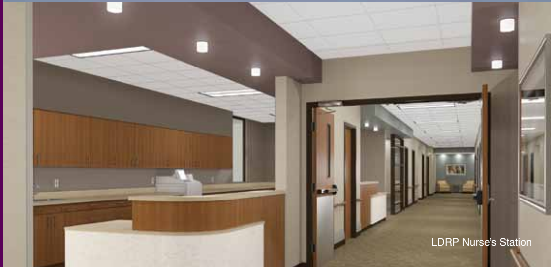
LDRP Nurse's Station