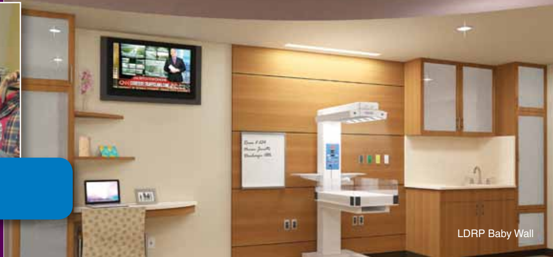
LDRP Baby Wall