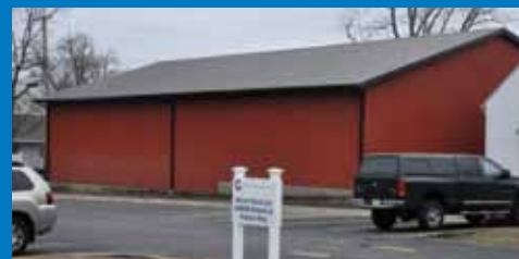
New GAHHS Patient Parking Lot and Storage Facility

A 4,000-square-foot, climate-controlled storage facility has been built across from the hospital. All of the equipment currently being stored above the ED will be housed at the new storage facility at a constant 72 degrees. ■