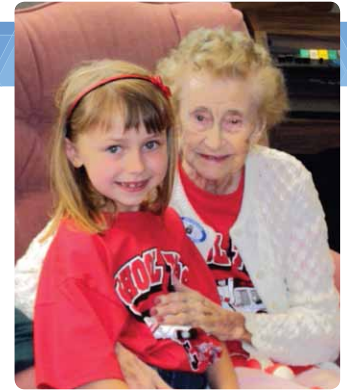
A PBL 1st grader takes time to talk with GAHHS Annex resident.